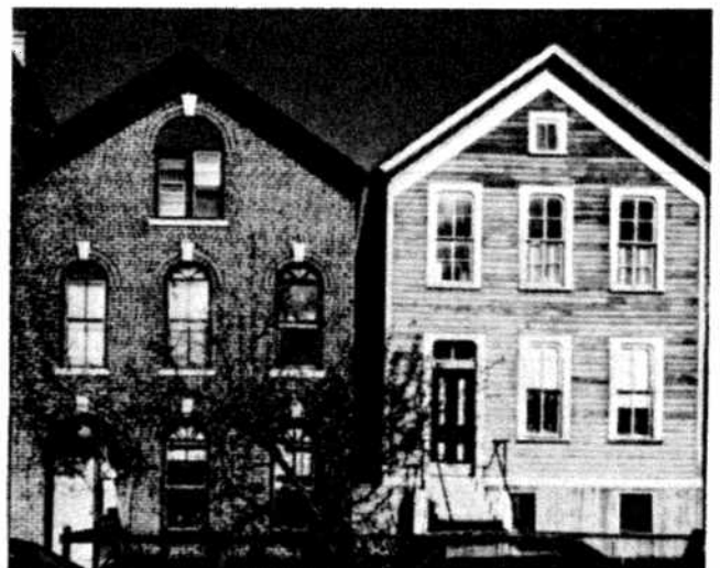
These two cottages at 220 and 222 W. Willow Street are typical of the type that used to house the working class people of North Town.

The cottages were small, often no more than twenty by thirty feet, and one or one-and-a-half stories high. The earliest cottages were built on log footings but later ones were put on high, common-brick foundations that formed raised basements. Often the basements were used for storage of coal and vegetables for winter. The rectangular balloon frame was sheathed in pine clapboards and topped with a pitched roof with gables facing front and rear. A broad flight of steps led to the entrance which was usually placed to one side of a pair of windows. Above, in the gable, was a window lighting the attic story. The ornament, true in form to the then-popular Greek revival style, was modest, accentuating with simple motifs the door and window openings and the pediment created by the gable. These cottages were well suited to the simple needs of Chicago's growing population.